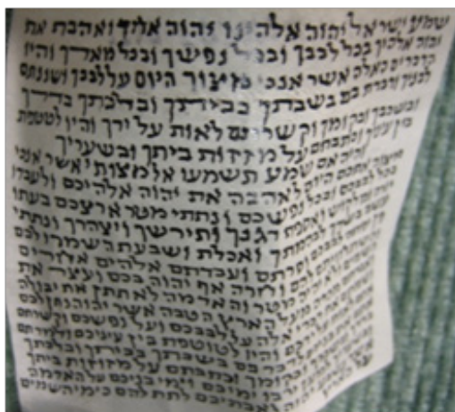
KLAF - Parchment from Mezzuzah