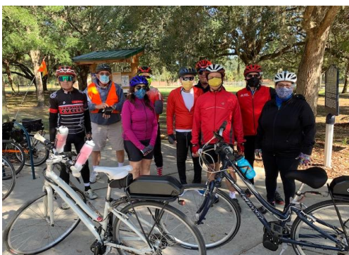
COS Pedalers monthly ride, wearing masks and enjoying the outdoors