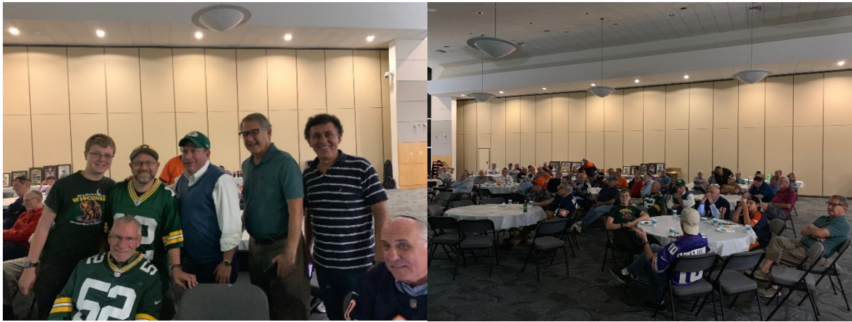
Above Left – Our Packers Contingent at Beth Shalom, Right – Time to Watch the Game