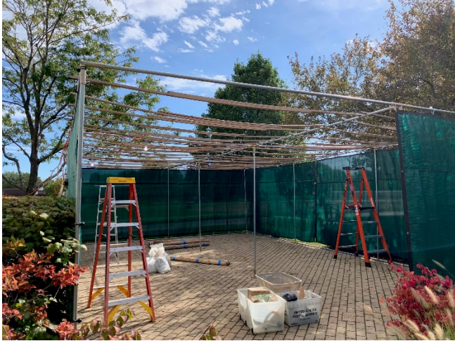
The Congregational Sukkah Under Construction

This is a great shared work experience for club members of all ages. Each year all attendees are treated to the traditional Men’s Club buffet breakfast.