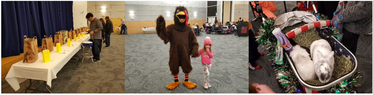
Above From the Left- The Raffle Sees Action, The Turkey Arrives! and Everyone Loves the Bunnies