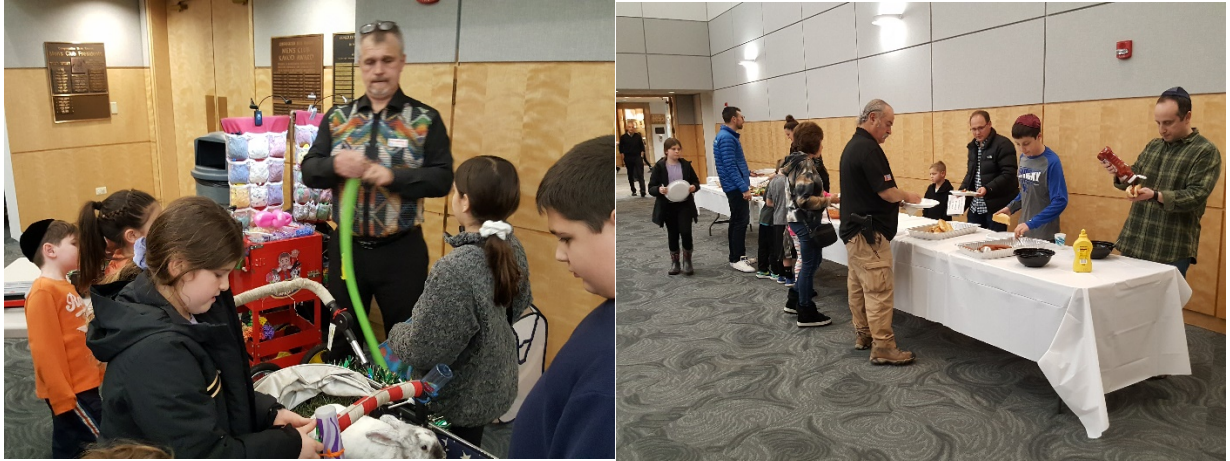
Above From the Left- Balloons for Everyone and Dinner is served