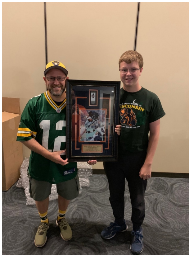
It's Funny How the Packer Fans Win the Walter Payton item in the Raffle